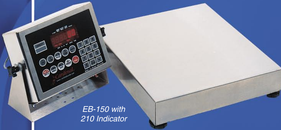
EB-150 with 210 Indicator

Designed for top performance and long-term accuracy.