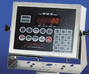
EB-300 with 210 Indicator