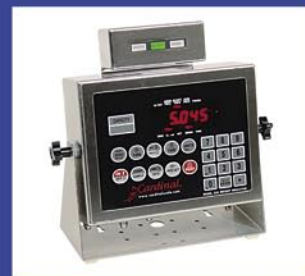
Optional checkweigher light bar for model 210.