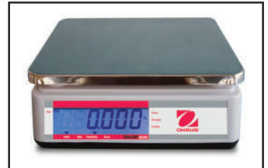
Rear display shown (dual-display models only)