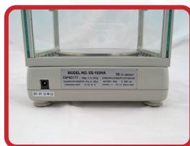
Removable Power Cord