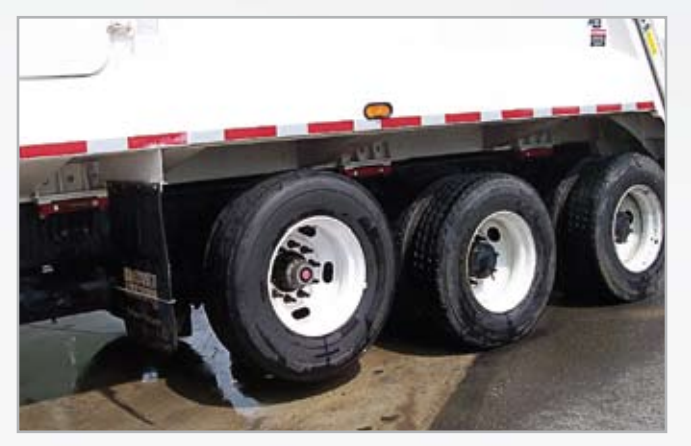
Six Point Under-Body Load Cell Kit

Groove Lock Load Cell Mount for Pivoting Bodies