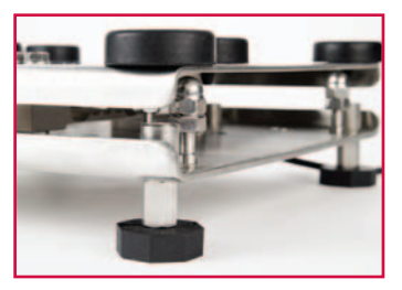
No Threads Visible Assures conformance to Food Safety standards and minimized contamination areas.